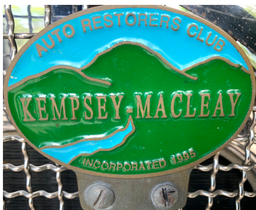
KMARC Original Car Badge fitted to Les Booth’s A Model Ford see photo on right

March 1997: Club had metal car badges created - 50 were produced and all sold very quickly at $15.00 each. The badge pictured is proudly mounted on Les Booth’s 1928 A Model Ford Roadster