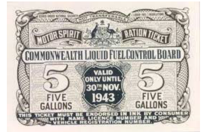
5 gallon rationing ticket

March: Petrol rationing was introduced in Australia in late 1940 and early 1941, but was not strictly enforced until 1942. The first ration tickets had a currency of six months. After that, issues were made every two months, to avoid forgeries and black market hoarding