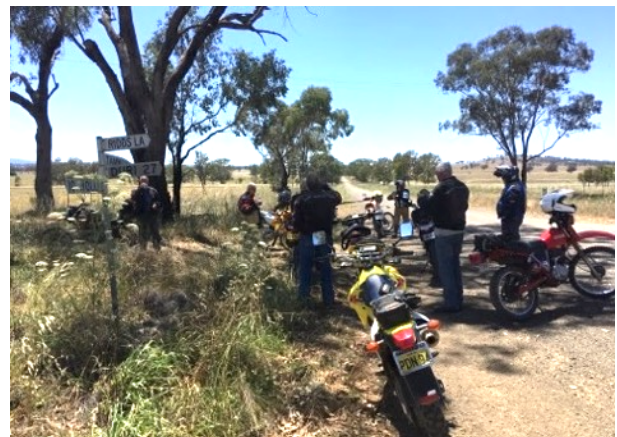
Time for a break and a yarn 27k from Duri

Thursday tar rides have dropped off a bit in popularity, most rides just around the block as we say.