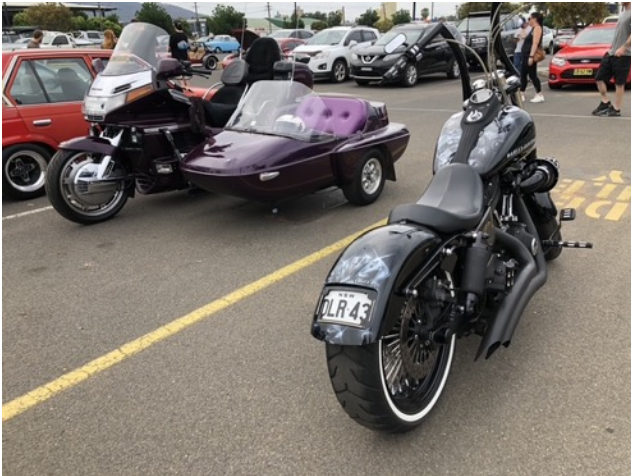
Wayne's Honda Goldwing with sidecar