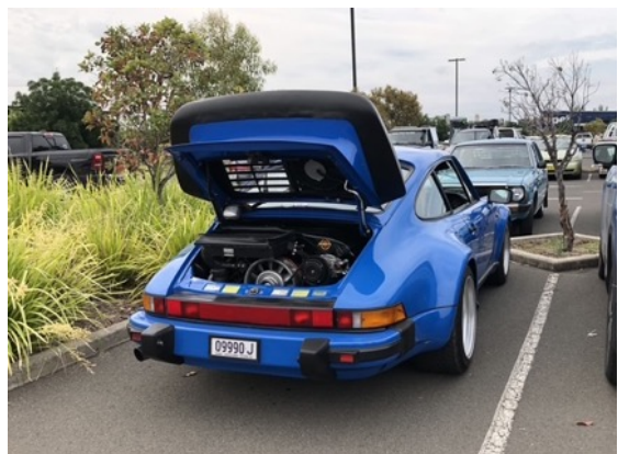
Brian Wiggs' Porsche