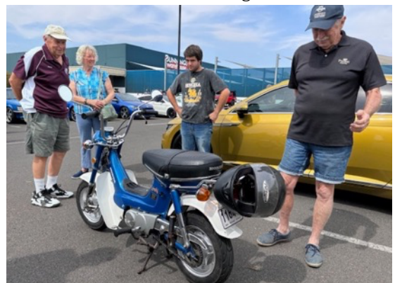
Tiny 1974 Honda CF70 created some attention