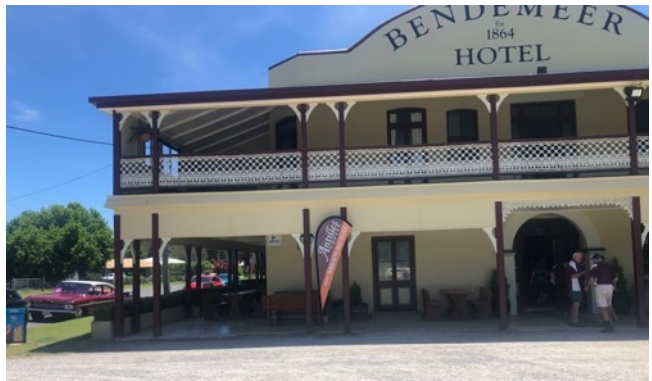
Historic Bendemeer Hotel built 1864