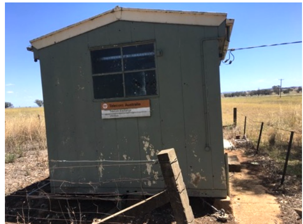
Winton Telephone Exchange