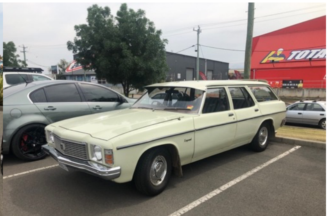
Grierson's Holden Kingswood