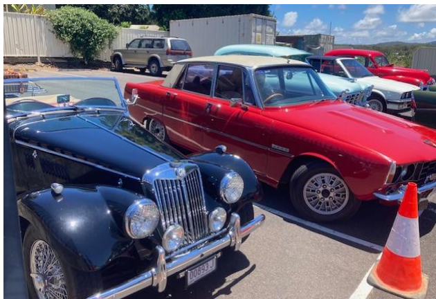
Members cars displayed in the Tavern car park