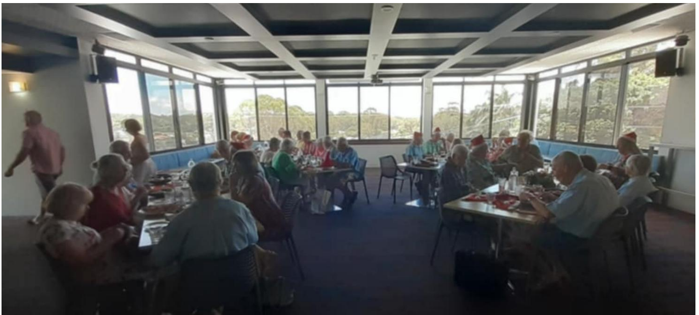
Our fellow members enjoying their well deserved meals