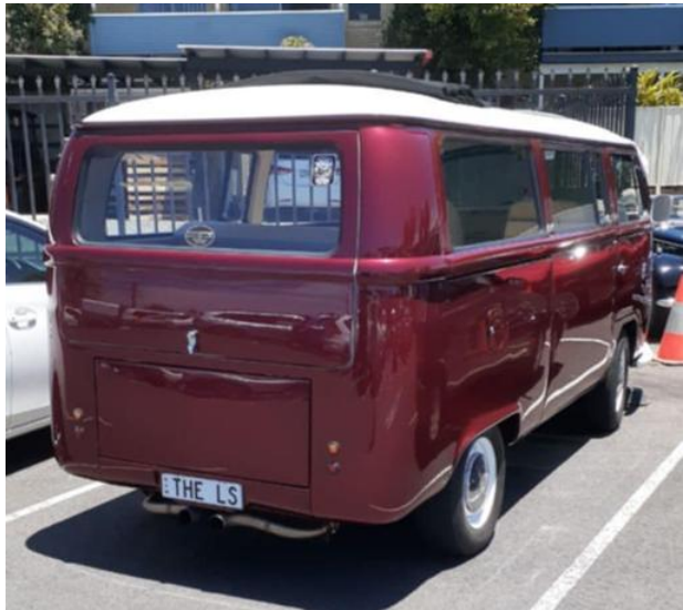
The Volkswagen Kombi parked near the car display